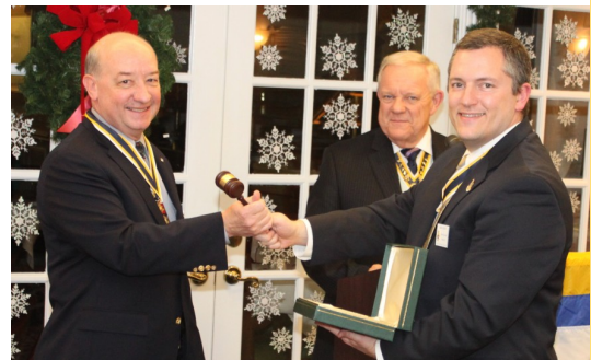
The passing of the Gavel.