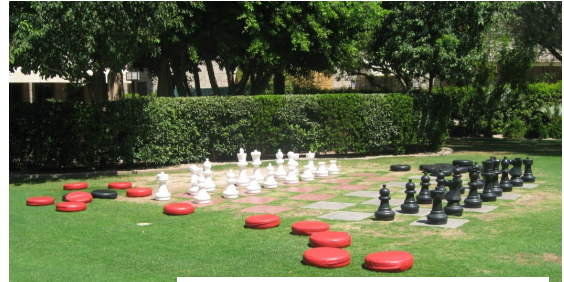
Congress was held on the grounds of the beautiful Biltmore Resort in Phoenix

Since approval of the Warren medal we have raised nearly $30,000 nationally and that is since July of this year. Our goal is to raise $700,000 so that the endowment will be worthy of distributing over $35,000 in scholarships each year.