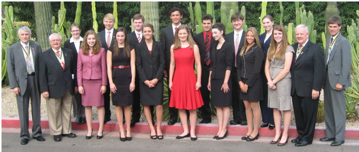
National Orations Contest Participants from 14 states with President General Magerkurth and members of the SAR Orations Committee .

These student orators are worth all the effort!